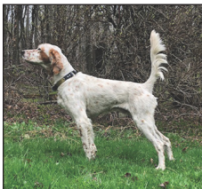
Super Storm Thor Kain, Owner